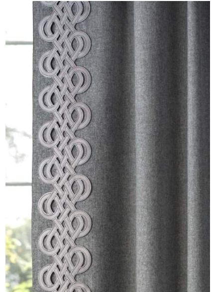
Shown top, from left to right: Nuova Laser Cut Border in Platinum and Venezia Appliqué Border in Granite and Marble Shown bottom, from left to right: Nuova Laser Cut Border in Platinum and Scala Laser Cut Border in Mercury