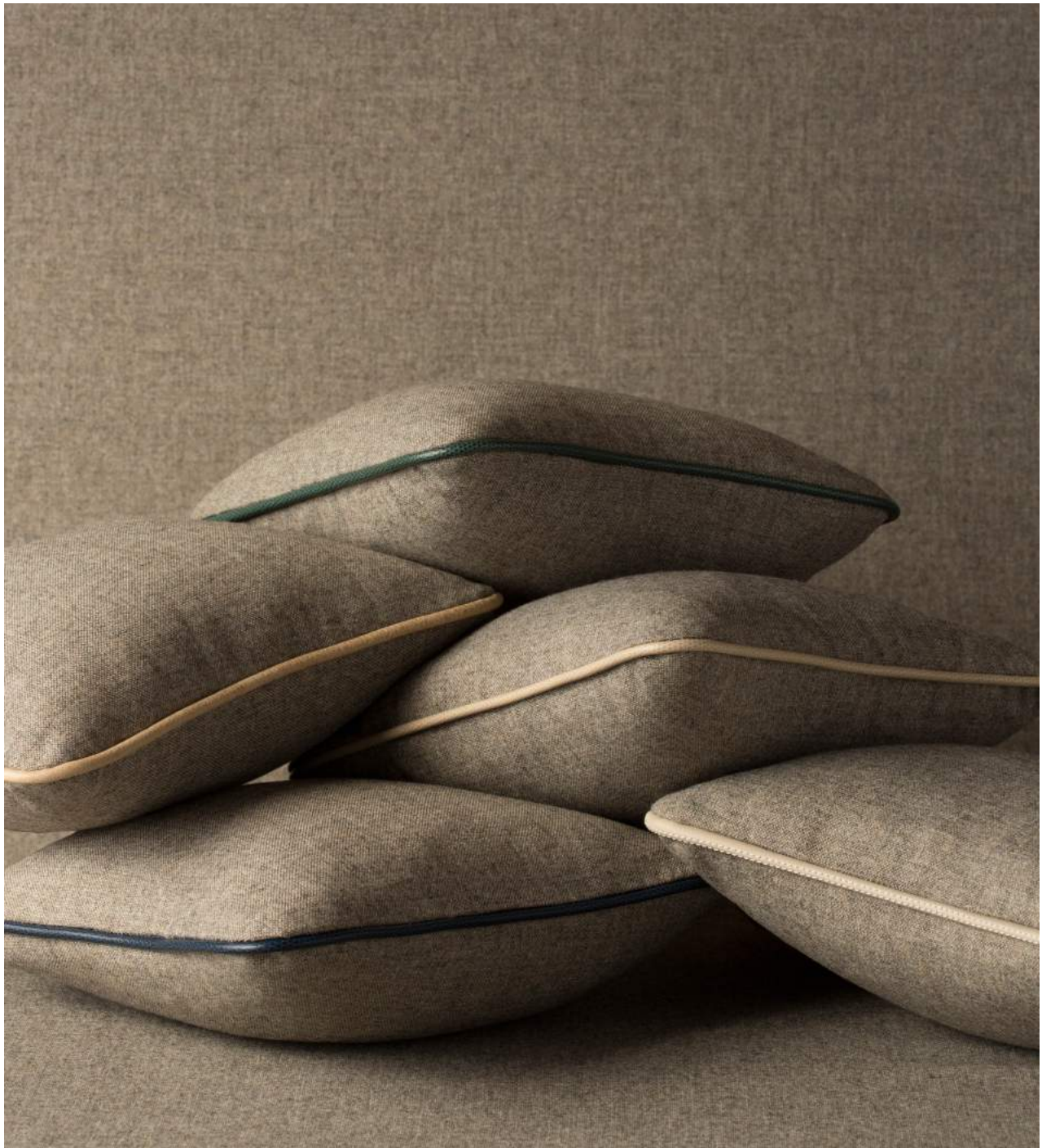
Shown above, from top to bottom: Spirito Textured Piping in Waterfall, Solferino Vintage Leather Piping in Sand, Spirito Textured Piping in Chamois, Paolo Faux Leather Piping in Oyster and Spirito Textured Piping in Cobalt Blue

For further information on Samuel & Sons, please contact Elle Ferrier by emailing elle@spreadpr.net or calling 212.696.0006