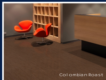
Col ombian Roast