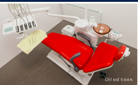
Oil ed teak