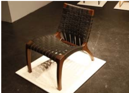
Latigo Chair, Bar/Buffer and Cocktail Stools