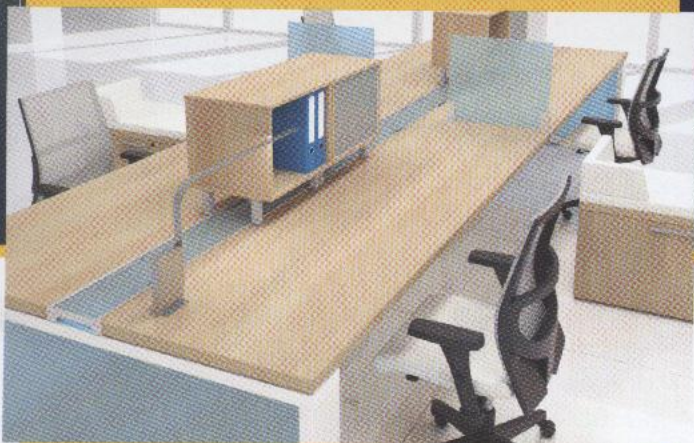
CITE BY GROUP LACASSE

Once again, the industry's largest conference and exhibition of contract furnishings for the design and management of the built environment, namely the NeoCon® World's Trade Fair, premieres its latest "wares" at the Chicago Merchandise Mart throughout the days of June 14-16. NeoCon is North America's largest conference and exhibition of this type and is one of the longest running trade shows in Chicago.