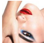
Crystal Renn for Vogue Mexico