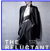
Lara Stone "Survival Of The Chicest" Vogue