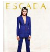
Escada Spring Summer 2011 Campaign