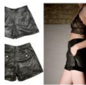
Spring Trends – Hare and Hart Pieces You'll Want To Wear Now!