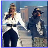
DJ Khaled Produces The Summer's Opener – I'm On One