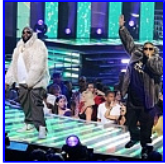
Weekend Discovery: 13 Fashion Trends for Men