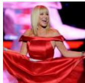
Heart Truth Runway Pictures Fall 2011 MBFW