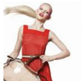
Sportmax Spring 2011 Campaign featuring Ginta Lapina