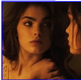
Burberry Is On Instagram Tweeting Rosie Huntington-Whiteley. Yes.