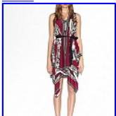
A Sharp Look in Vogue Japan