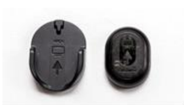
Caption: The S 4.0 sensor is as small as a coin and provides important information about an individual's sitting behaviour.