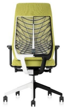
Caption: Backrest frame, chair column and base are available in two colour concepts – black or light grey.