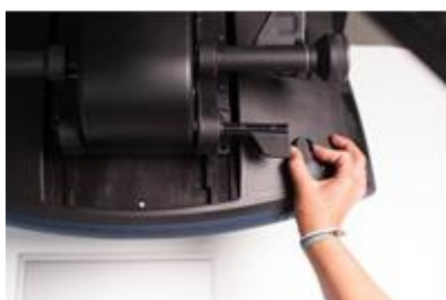
Caption: The sensor is very easy to fix in place on an office chair.