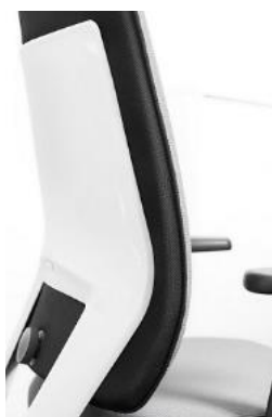
Caption: High-grade decorative welted seam between the upholstery cover and technical fabric.