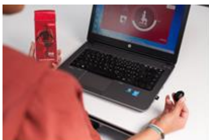
Caption: With the S 4.0 seat sensor, Garmin and Interstuhl are bringing more movement into everyday office life.