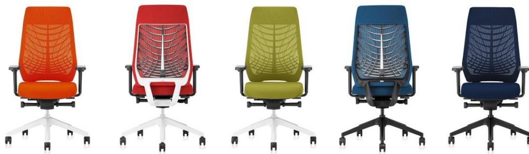
Caption: JOYCEis3 particularly stands out thanks to its wide variety of colour options.