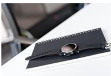
Caption: Compatible Garmin watches, such as those in the fenix 5 series, can be easily linked to the sensor.