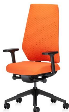
Caption: With the new Softback, JOYCEis3 combines the advantages of a traditional upholstery with those of a mesh cover.

Company Interstuhl Büromöbel GmbH & Co. KG Brühlstraße 21 72469 Meßstetten-Tieringen Germany Tel.: +49 (0) 7436 871 0 Fax: +49 (0) 7436 871 110 info@interstuhl.de interstuhl.com